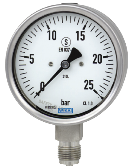
Bourdon Tube Pressure Gauge Model 232.30

or all other equivalent vacuum or combined pressure and vacuum ranges